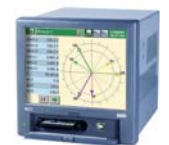
Analyser of network parameters ND1.