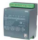
Transducer of network parameters P43.