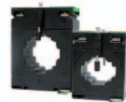
Current transducers LCT type.