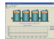
LUMEL - PROCESS SOFTWARE